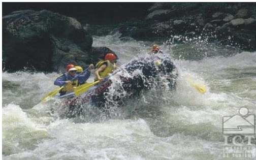
Rafting at the Pacuare River

As an international student, you will not simply learn Spanish and travel around to see new places you will find a whole new world and a different way of life. Make friends that will last a life-