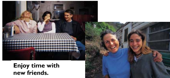
Enjoy time with new friends.

The program includes two daily meals, laundry and ironing and optional educational tours. Enjoy delicious meals and activities with your host family. They'll make you feel at home!