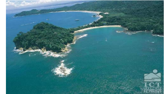
Manuel Antonio Park, Costa Rica

You'll live with a good host family and travel around this beautiful country.