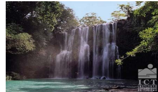
Bagaces Waterfalls, Costa Rica

In Costa Rica, you'll find magnificent flora and fauna, impressive beaches, powerful volcanoes and deep jungles.